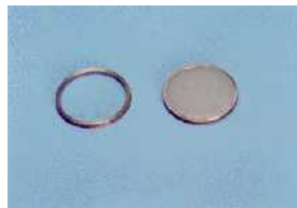
Fig. 1. The cylindrical ring used in the absorption and solubility measurement.