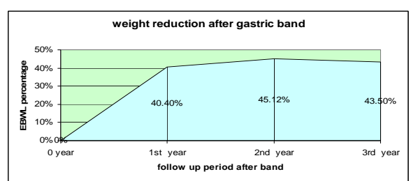
Fig1: line chart demonstrates weight reduction after gastric band

diagnosed in a significant proportion of patients, there were 30 patients (12%) discovered endoscopically and radiologically to have pouch dilatation. Five patients had a sever pouch dilatation and returned to theater for band removal ( tow of them reoperated early dilatation after 8 and 9 months and the others developed later dilatation on 22<sup>nd</sup>, 28<sup>th</sup> and 34<sup>th</sup> months respectively after the procedure), and then 13 patients appointed to remove band because of dilatation.Band migration was uncommon complication, occurred in 2% of cases, and diagnosed after 24-48 months after surgery. Since band migration is serious complication, all patients with migration reoperated for band removal. Band erosion occurred in 4 patients; two incomplete patients have erosion removed surgically, while the other two patients, referred to gastroenterologist for endoscopic band removal due to complete erosion and the band was found completely the stomach. Hence Gastroesophageal reflux disease is known to be relatively contraindicated for band insertion. patients underwent gastroscopy surgery. Gastroesophageal reflux is common complication, and it was the most common cause of patient's discomfort, an 18 patients suffering from heart burn, which was not present before surgery, most of them respond to Proton pump inhibitors like omeprazol, and only 3 patients reoperated for band removal after tow years of surgery. (Figure 2).